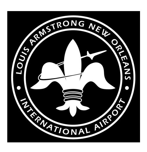
White color reversed for dark backgrounds only