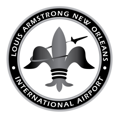
Alternate Black on light backgrounds only - this version only available for special requests