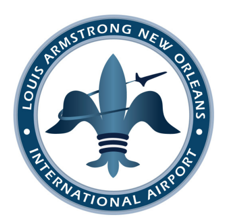
Full Color for use against white background only

In situations that require the logo be displayed on a dark color field, a white or reversed image should always be used without exception.