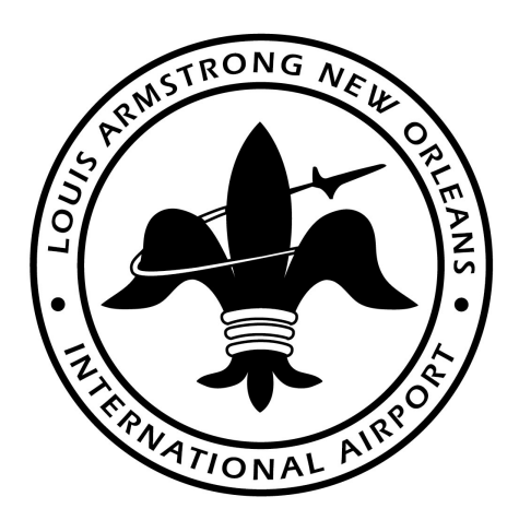
Black or Pantone Color on light backgrounds only