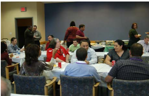
NOAB employees trade their recipes