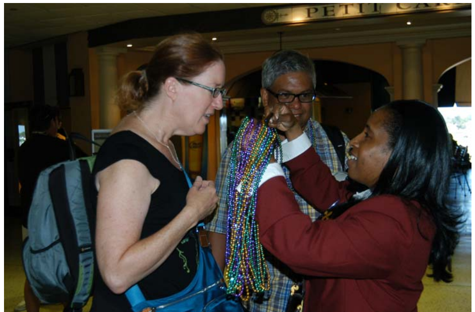
Customer Service Rep greets arriving passengers with beads