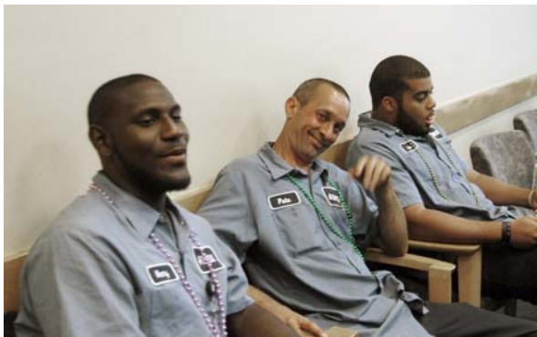
New NOAB Airfield Maintenance employees were welcomed with souvenir beads