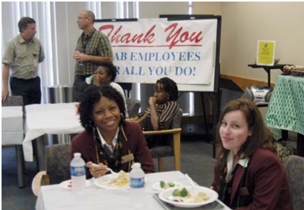
Ladies from the new Airport Customer Service Department in their new look

The New Orleans Aviation Board employees gathered in September for a potluck luncheon. As usual, the food was outstanding and the attendance was great. ✈