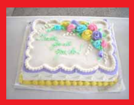
Thanks to all of the NOAB employees that helped with the planning, set-up and clean-up of the Spring NOAB Crawfish Boil. We passed a good time.