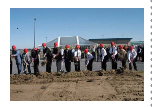
Groundbreaking ceremony for the new Aircraft Rescue and Firefighting Station

Ongoing is the $36 million phased Apron Rehabilitation which also got underway last fall. On March 11, the KickOff Ceremony for the Expansion of Concourse D was held. This project originally began in 2003. All was put on hold after Hurricane