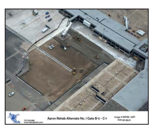
Apron Rehabilitation - Concourse B