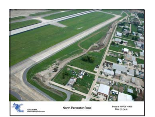
North Perimeter Road