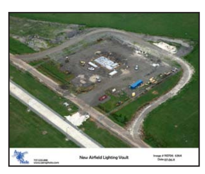
New Airfield Light Vault