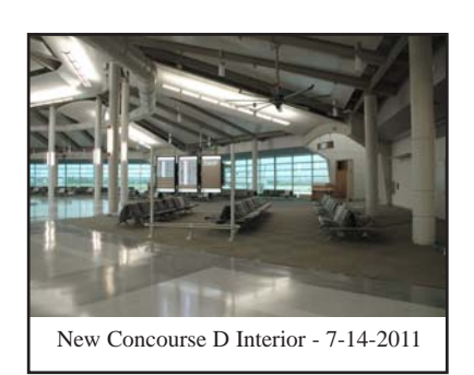
Concourse D Expansion